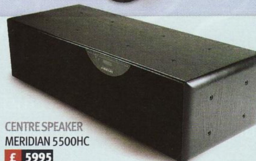
CENTRE SPEAKER MERIDIAN 5500HC

So we've got our surround processor, CD player, speaker system: what else do we need? A DVD player? Meridian can help you out there, offering the Reference 800 at £10,805. Need some deep bass? The two 30cm drivers in the SW5500 subwoofer should round it all off nicely.