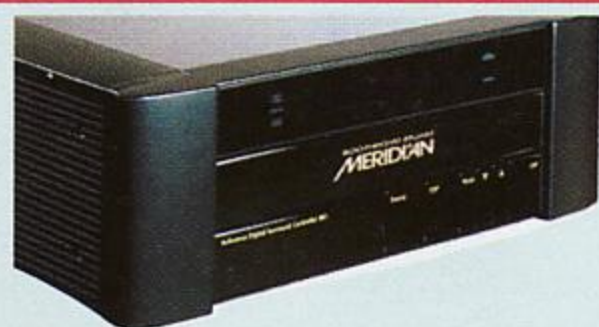
SURROUND PROCESSOR MERIDIAN REFERENCE 861 ★★★★★