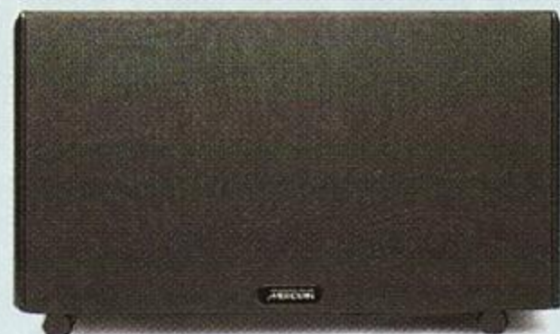
SUBWOOFER MERIDIAN SW5500

Fancy expanding your Meridian experience? Add the Reference 861 surround processor, and you can decode the majority of surround sound signals available, connect up more speakers and listen to music and movies through variables of two, three, five or seven channels, plus subs.